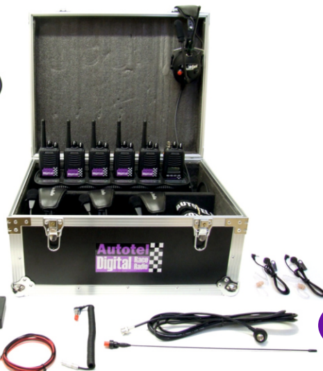
NX9200 GT Saloon car system