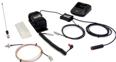
NX9000 Single Seater System